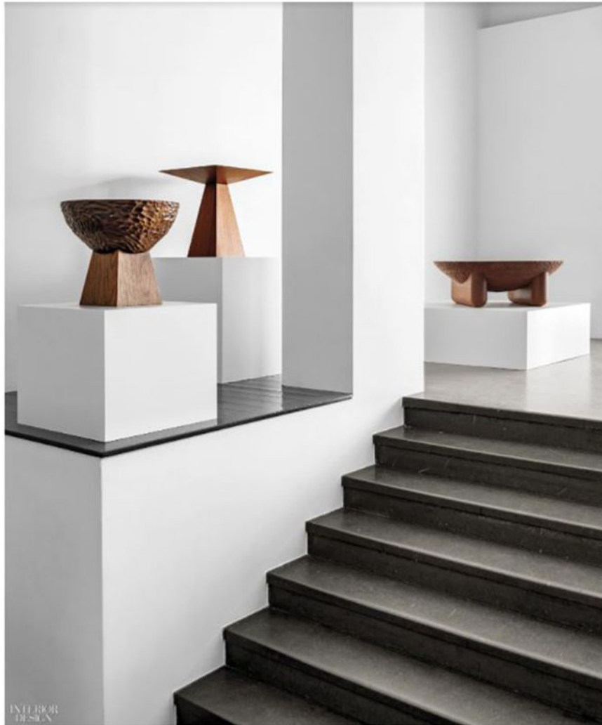
SKS01 and SFS01.