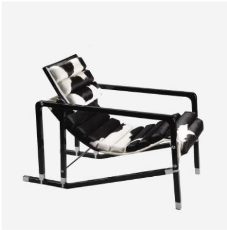
Eileen Gray's Transat chair, available from The Invisible Collection.