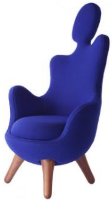
Vincent Darré's Conversation armchair.