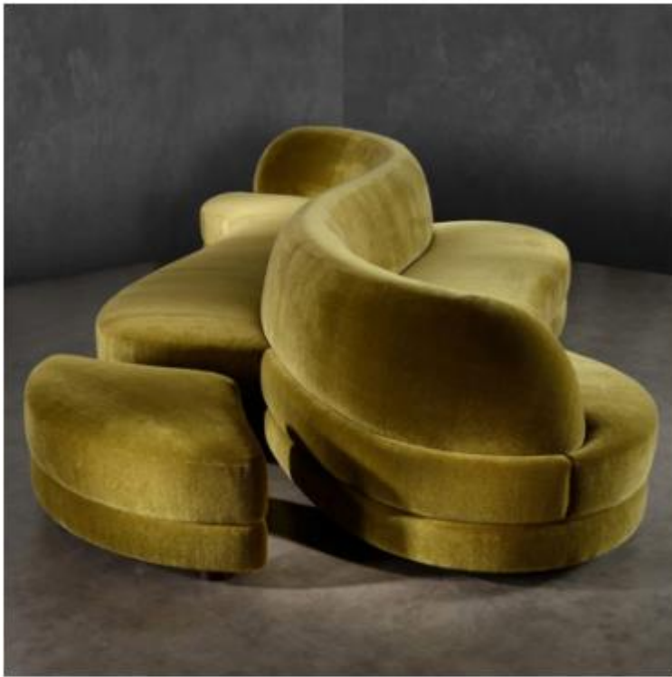
Charles Zana's Julie sofa.